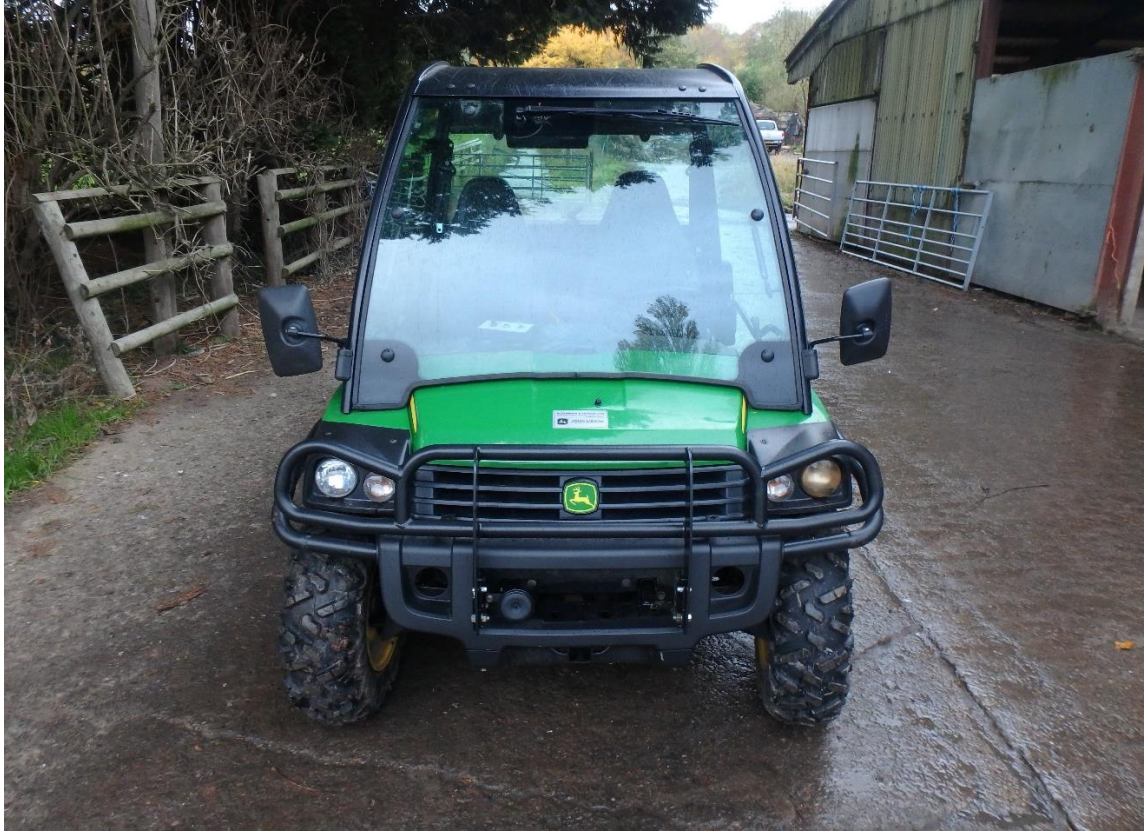
John Deere Gator 855d 4wd (2013) On farm from new.