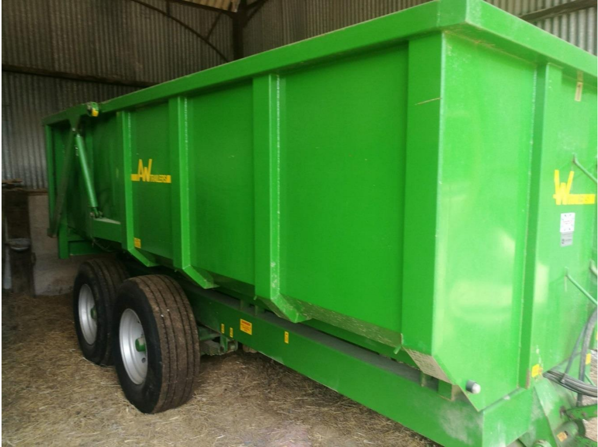
AW 8t Trailer Twin Axle (2002)